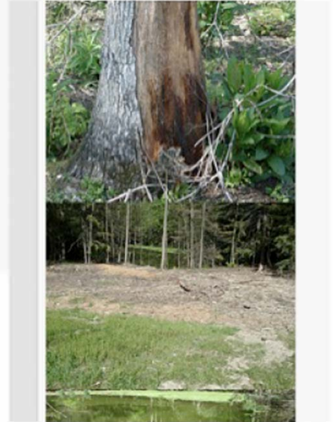
Screen shots of water complaints made on WellWatch and the beginning of a WellWatch report that was supplemented with photographs of damage to plants following a spill.